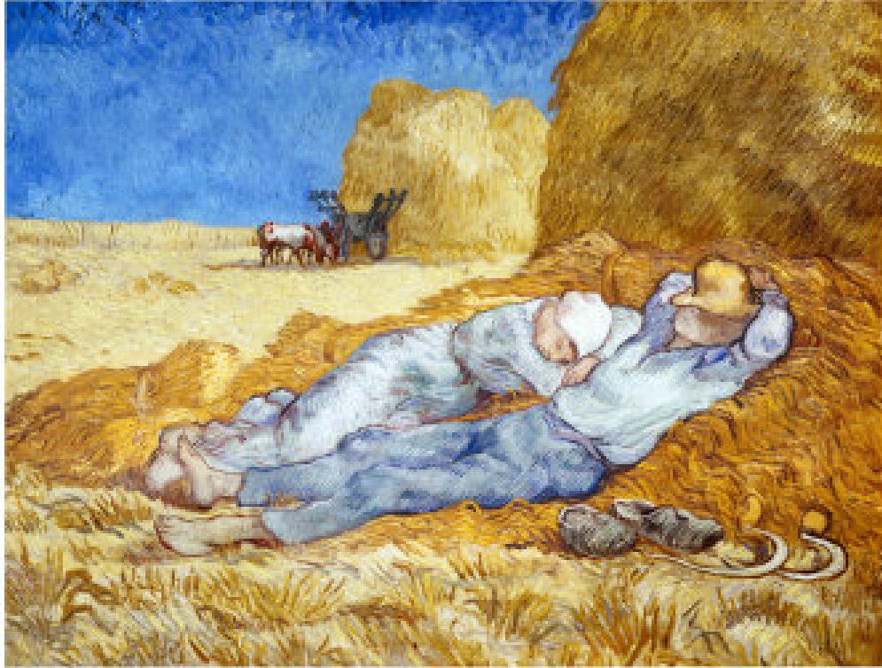
Rest from Work, 1890 by Vincent Van Gogh

Exodus 23:12 Six days you will do your work and on the seventh day you will rest: so that your ox and your donkey may rest and the son of אִמְרָתְךָ your maidservant and the foreigners may be refreshed. C-MATS