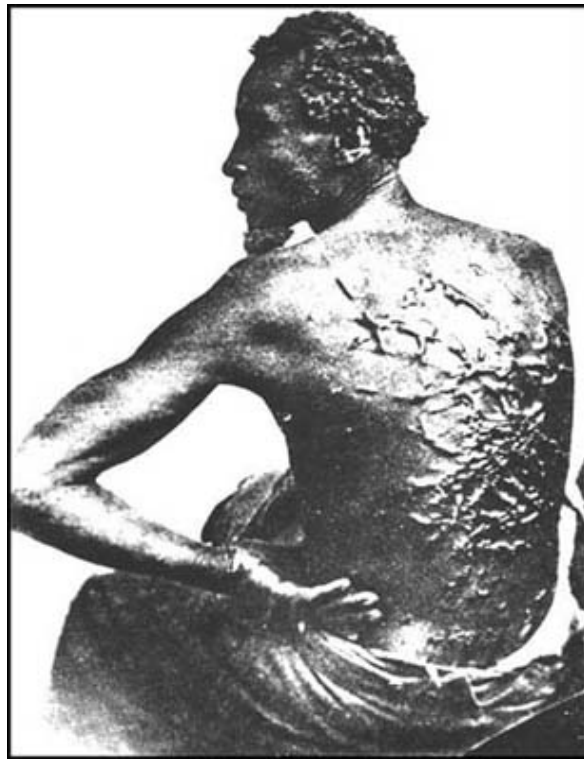
Scars left on slave beaten by his master

Question: How long is this time period? The master would not willingly destroy his personal property, so that is why a full twenty-four hour period is given. But if someone other than his master struck him, even if he lingered for twenty-four hours before he died, the other person is liable to incur the death penalty. Chumash