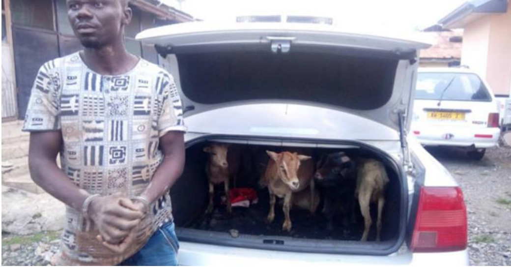
The thief must restore double.

Question: Can a person ever act dishonestly and 'get away with it'? It depends what and who he is trying to 'get away' from. There are three levels of awareness of every act we do: the awareness of other people, our own awareness, and that of יהוה . It is possible that our act might escape other's awareness - although less often than we might hope, however we, ourselves will always be aware of our behavior and acting dishonestly will lower our self-esteem even if we are not conscious of it doing so. What is more, יהוה is intimately aware of our every thought, word, and act. In fact our tradition teaches that part of our afterlife consists of being shown a detailed 'replay' of our entire lives and the more our choices reflected our higher values the more positive will the experience be.