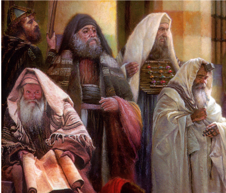
Yahusha came to the scribes and Pharisees