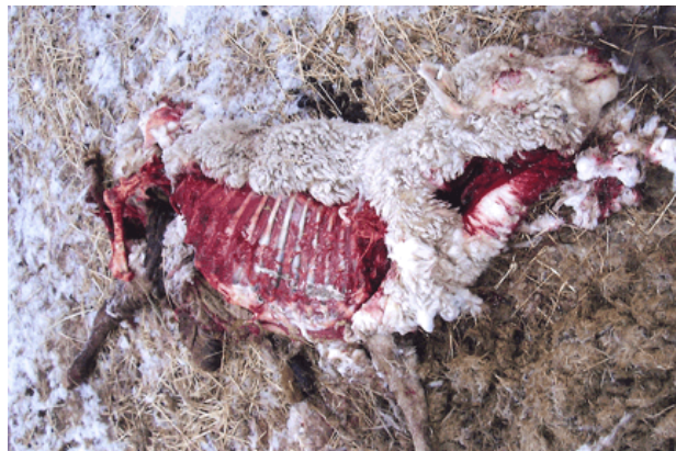
Evidence of sheep torn by wild beasts

Exodus 22:12 And if the possessions are stolen from the neighbor , he will make restitution to the owner of it. 13 If the beast is torn in pieces, then let the neighbor bring it as a witness and he will not have to make restitution for that which was torn by wild animals. C-MATS