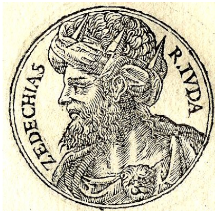
King Zedekiah (1553 etching published by Guillaume Rouille)

Jeremiah 33:25 So says יהוה; If My covenant be not with day and night and if I have not appointed the ordinances of heavens and earth; 26 Then will I cast away the seed of Jacob and David My servant, so that I will not take any of his seed to be rulers over the seed of Abraham, Isaac and Jacob: for I will cause to return אֶת־ their captives and have mercy on them. C-MATS