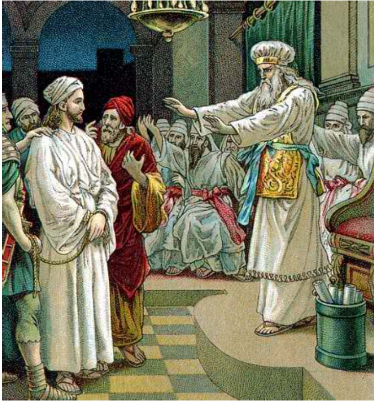
Before the Court

Question: What does Yahusha say about this law? Matthew 5:38 You have heard that it has been said, An eye for an eye, and a tooth for a tooth: 39 But I say to you, That you do not resist evil: but whosoever hits you on your right cheek, turn to him the other cheek also. 40 And if a man sues you at court and takes away your shirt, let him have your coat also. 41 And whosoever compels you to go a mile, go with him two miles. 42 Give to him who asks you for something, and do not turn away from someone that wants to borrow from you. C-MATS