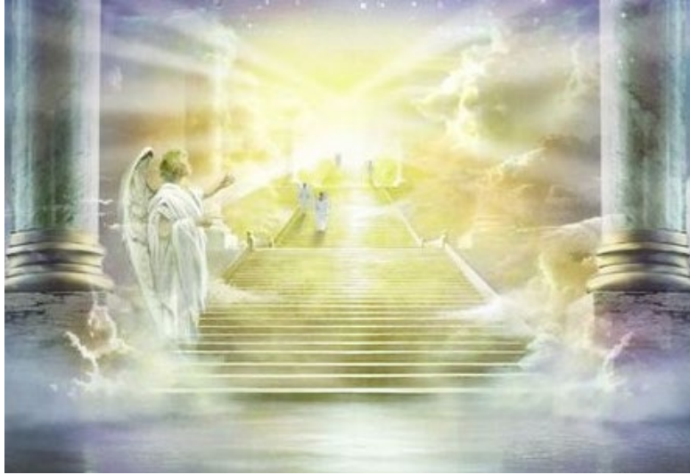
The Throne of יהוה

Exodus 24:9 Then Moses and Aaron, Nadab and Abihu and seventy of the elders of Israel went up (the mountain) : 10 And they saw את Elohim of Israel: and under his feet there was something like a sapphire stone pavement as clear as the sky itself . 11 And He did not reach out His hand against the nobles of the Children of Israel : they saw את Elohim and ate and drank with Him . C-MATS