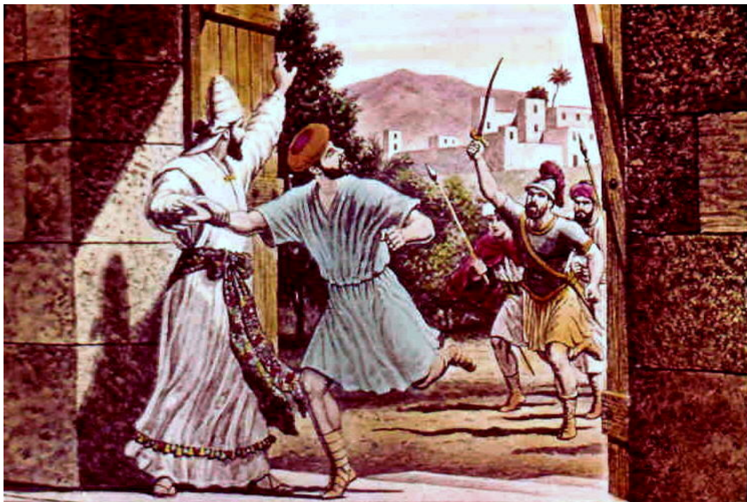
Victim flees to City of Refuge

Question: What does it mean by an act of יהוה? Events are not haphazard. Always there is the guiding hand of יהוה. When someone is struck by the tragedy of having unintentionally killed a fellow human being, surely a traumatic experience, he should realize that since יהוה had caused it, it indicates that he must have committed some sin or crime that went unpunished, and that this current victim must have been guilty of a capital offense that went undetected. By causing one person to cause the other's death, יהוה was squaring the accounts for יהוה's justice is unimpeachable; it is only we who are incapable of comprehending it. When a child is killed accidentally, this indicates that the parent of the child must have committed some sin or crime that went unpunished.