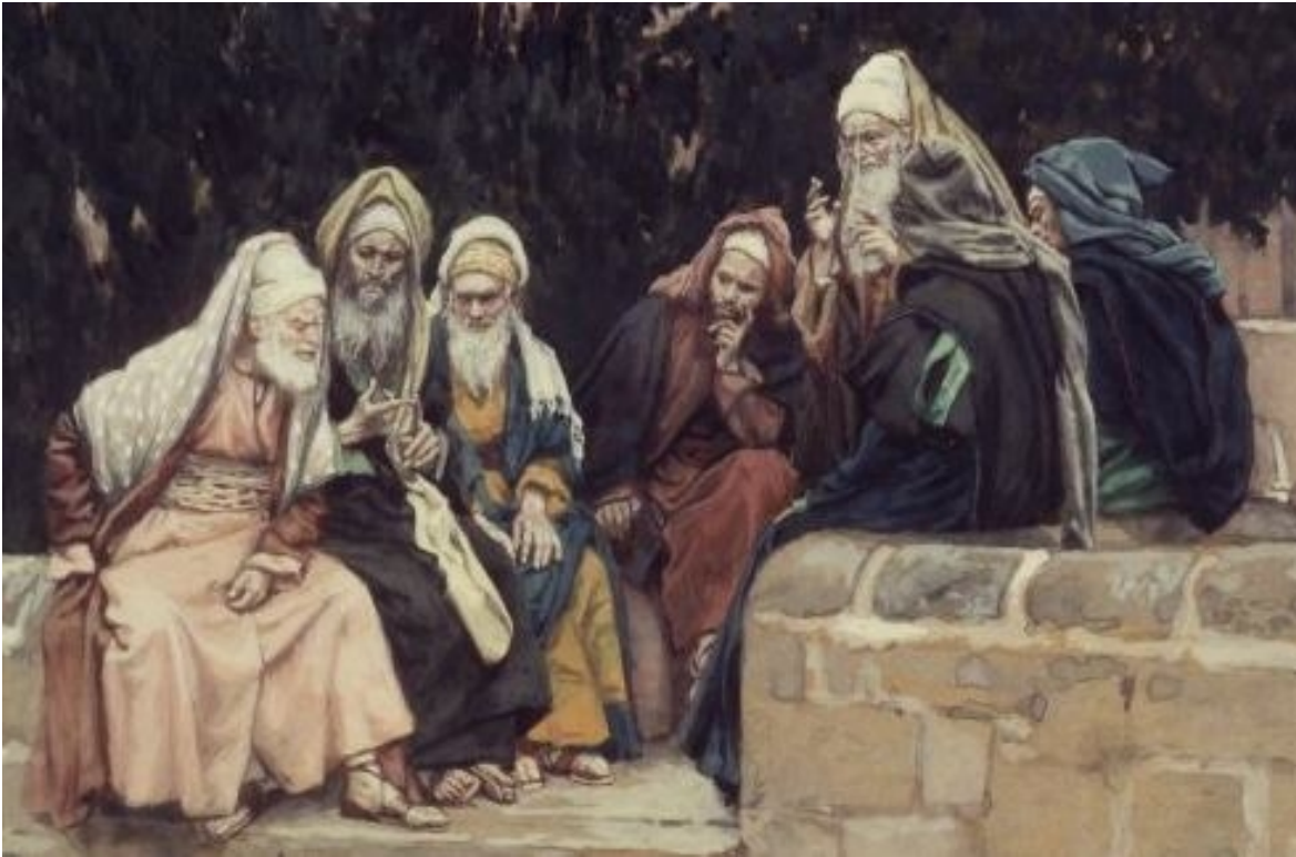
Instructions of Torah

Exodus 21:1 Now these are the judgments which you will set before them. C-MATS