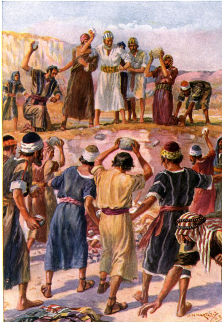
Witch being stoned

Question: What is meant by “ seduces a virgin ”? Seduction is theft of the heart . The man speaks to her heart until she yields to him. He should marry her, but only with the father’s permission. The seducer should treat her as respectfully as any husband would treat his wife. Chumash