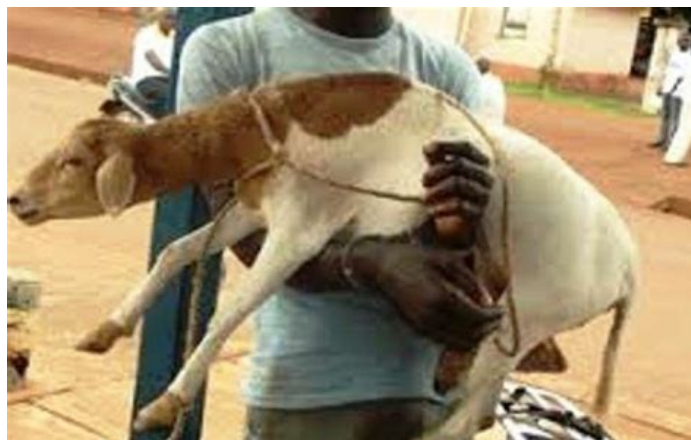
Man stealing a goat

Chapter 22 is a continuation of the previous one and continues the laws of thieves and their penalties. In the Torah there are no chapters. The division of the Torah into the commonly used chapters is a device began by Italian printers. The Bible scholars responsible for the divisions did not take into account the interpretations of the Torah as it was transmitted from Sinai.