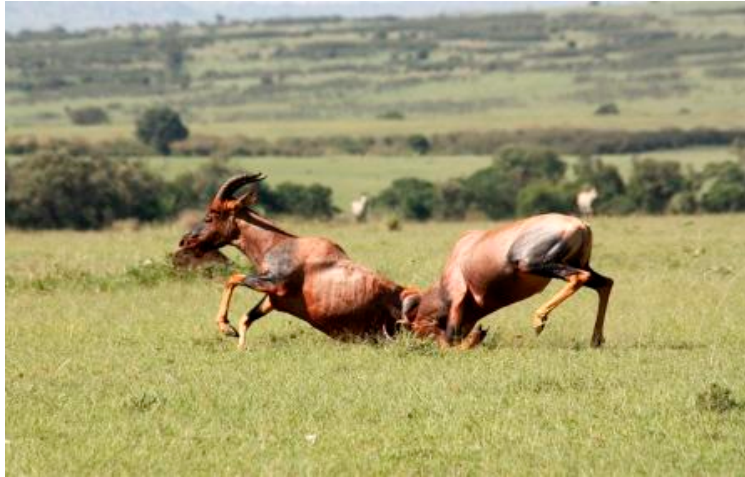
Keep a goring animal contained.

Question: Do you think monetary and property laws, etc. have anything to do with being righteous? Being righteous doesn't mean being apart from the world, rather being involved with the world, but in an elevated way. Therefore, certainly acting fairly and ethically with ours and other's property is a big indicator of how righteous we are.