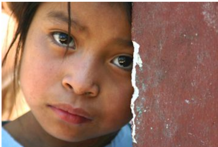
Be kind to orphans

Exodus 22:19 Whoever has sexual relations with a beast will be put to death. 20 He who sacrifices to any god except to ליהוה only, he will be destroyed. 21 You will not mistreat a stranger or oppress him: because you were strangers in the land of Egypt. C-MATS