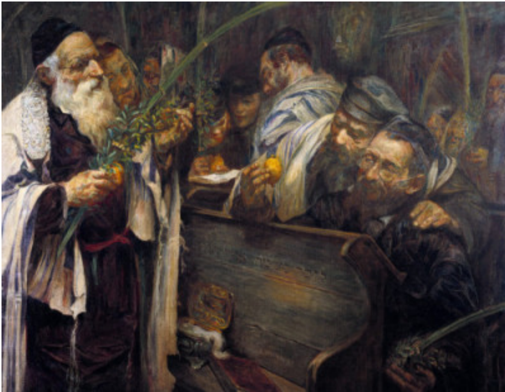
Celebrating Sukkot with the Four Species (painting circa 1894–1895 by Leopold Pilichowski)

Exodus 23:17 Three times in the year all your males will appear before Adonai יהוה. 18 You will not offer the blood of My sacrifice with leavened bread; neither will the fat of My sacrifice remain until the morning. 19 The first ( best ) of the firstfruits of your land you will bring into the House of יהוה your Elohim. You will not boil a kid in his mother's milk. C-MATS