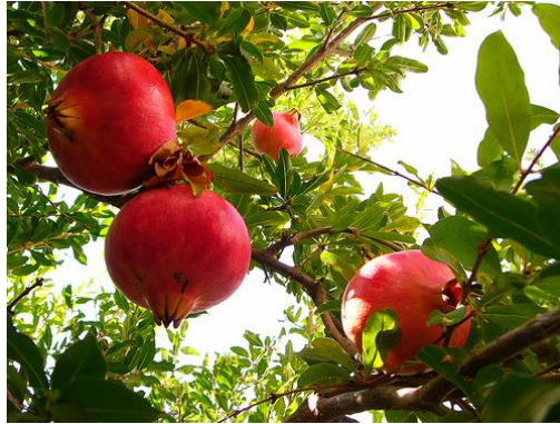
Do not destroy fruit trees.

Question: What are some ways we can fulfill the Torah's instruction of being careful not to misuse the יהוה -given environment in our daily lives? When we are careful not to waste food, break things, or throw out perfectly good usable items just because we feel like it, we are fulfilling this commandment. Even by simply remembering to turn off lights, appliances, or the water faucet when not needed, we help do our part to respect and take care of יהוה 's world.