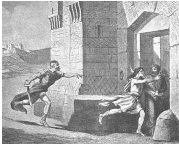
City of Refuge

Question: When does this not apply? This verse does not apply to an unfavorable prophecy that was voided because the people repented and so earned a reprieve -- such as the repentance of Nineveh that prevented its destruction. And saw Elohim את־ their works that they turned from their evil way; and Elohim repented of the evil which He said He would do to them; and He did not do it. Jonah 3:10. It could not apply to a favorable prophecy that could not be fulfilled because of the people's later sins -- such as Jacob's fear that his sins might have cost him יהוה's promise of protection from Esau. Deliver me, please, from the hand of my brother, Esau: because I am afraid of אתו־ him, otherwise he will come and attack me and the mothers with the children. Genesis 32:11.