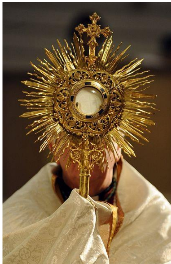
Sun Worship-Catholic Deity (Sunday)