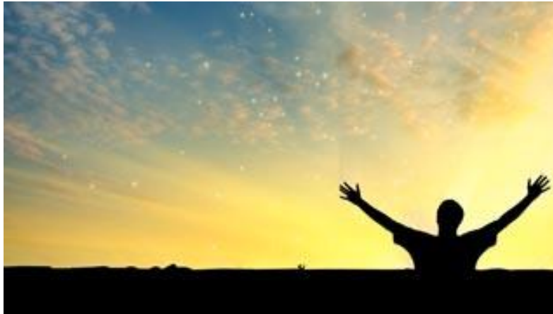
Do not worship the sun, moon, stars

Deuteronomy 17:1 Do not sacrifice to ליהוה your Elohim any bullock or sheep, which is blemished or has a defect: because that is an abomination to יהוה your Elohim. 2 If there is found among you at any of your gates in your cities, which יהוה your Elohim gives you, a man or woman who has been אֵת wicked in the sight of יהוה your Elohim by transgressing His covenant, 3 And has gone and served other gods and worshipped them, either the sun, moon, or any of the host of heavens, which I have not commanded for you to worship . C-MATS