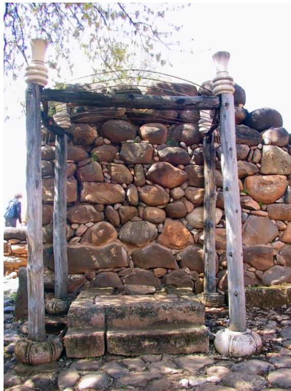
Judge's seat at the city gate

Question: Who is the One who passes judgment? After someone is found worshipping other gods he is to be brought before the Levites who, will show you אֵת sentence of judgment...implying the judgment and sentence will come from אֵת. C-MATS