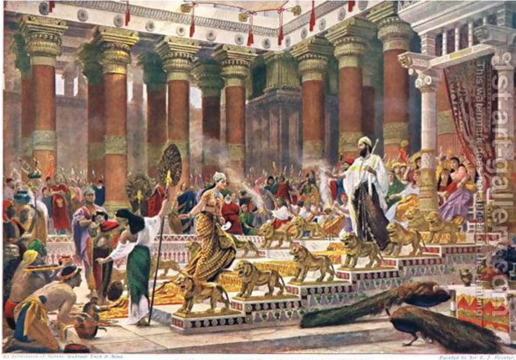
THE VISIT OF THE QUEEN OF SHEBA TO KING SOLOMON. Painted by Sir E. J. Poynter.