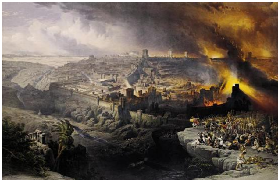
The Siege and Destruction of Jerusalem by the Romans Under the Command of Titus, A.D. 70 by David Roberts 1850

Question: What should the Israelites do about Canaanites who want to convert and worship יהוה? It was forbidden to permit any pagan Canaanites to remain, even individuals, because their modes of service to their deities would filter into the Israelite community. Even if Israelites were not to become idolaters, they would use those abominable practices to serve יהוה. But as time went on the danger was even greater: you will sin to יהוה, by actually worshiping their idols. The fact is that these dire warnings came true. Israel permitted many Canaanites to remain, and the result was that idolatry did become prevalent among Israelites and caused the many disasters that are recorded in Scripture. Chumash