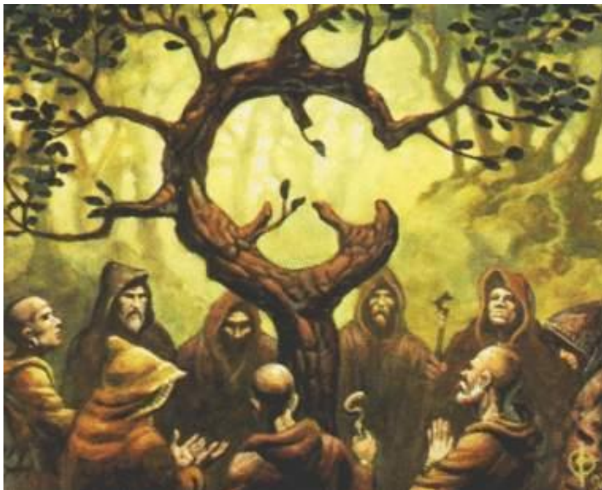
Celtic countries thought trees had special powers or served as the abode of the fairies

Question: Should we judge other believers? 1 Corinthians 5:9 I wrote to you in an epistle not to keep company with fornicators: 10 Yet not only with the fornicators of this world, but with the covetous, extortioners, or idolaters; in that case you would have to go out of the world. 11 But now I have written to you not to associate with any man who calls himself a brother who is a fornicator, covetous, idolater, slanderer, drunkard, or extortioner; do not eat with such a one. 12 For what have I to do with judging those who are outside in the world? Don't you judge only those who are our brothers? 13 Elohim, will judge those who are outside. Therefore put away from among yourselves any wicked person. C-MATS