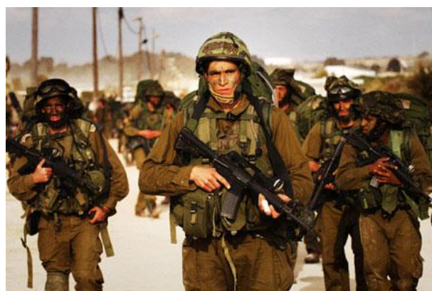
When Israel Goes to War

Question: What does Yahusha say about this law? Matthew 5:38 You have heard our fathers have said, An eye for an eye, and a tooth for a tooth: 39 But you do not resist evil: but whoever hits you on your right cheek, turn to him the other one also. 40 And if any man sues you and takes away your shirt, let him have your coat also. 41 And whoever compels you to go a mile, go with him two. 42 Give to him who asks you, and do not turn away from him who wants to borrow from you. C-MATS