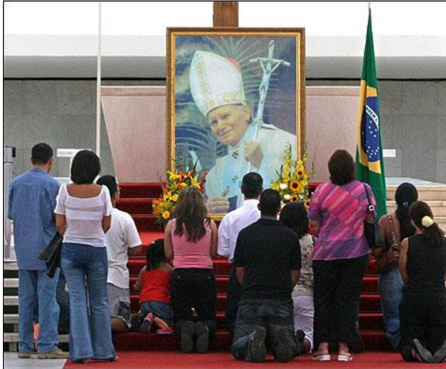
Catholic Pope-Catholic Deity