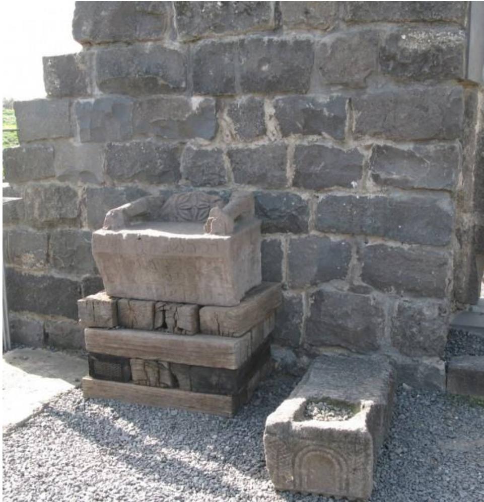
Judgment seat at the city gate

Before he dies Moses reviews for the Israelites their system of justice, the rules of kingship, their relationship to idolatrous nations, and the rules of doing battle.