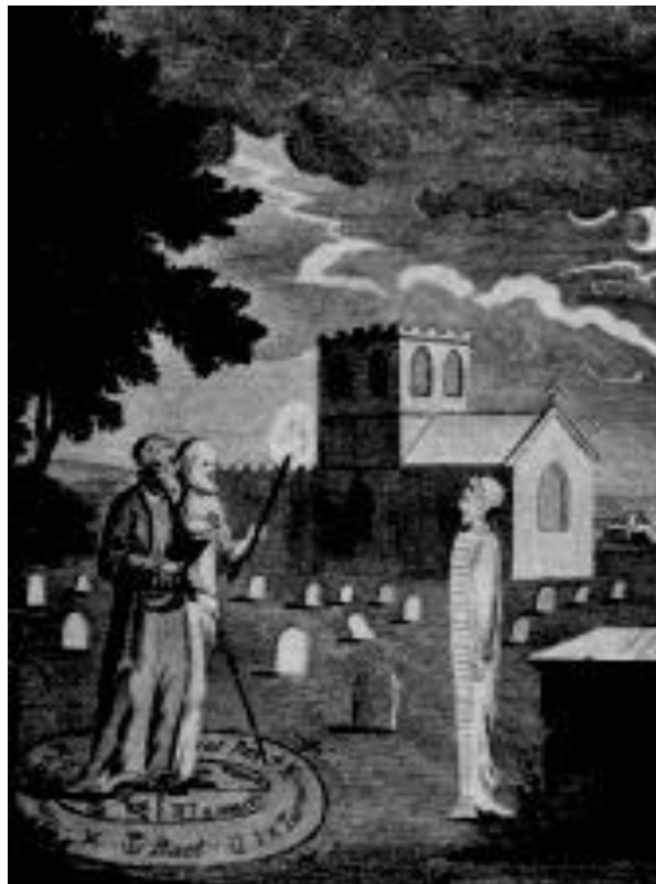
John Dee and Edward Kelley evoking a spirit: Elizabethans who claimed magical knowledge

9. Necromancer -one who raises the dead spirit upon his membrum (member), or one who consults a skull. It is the alleged power to communicate with the spirits of dead people (“ghosts”).