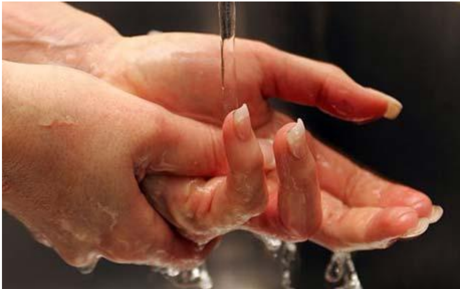
Wash your hands from the shedding of innocent blood.

Question: How can a person know whether he is properly or improperly partaking of the world's resources? The rule of thumb is: use it, but don't abuse it. We should relate to it as a valuable gift from יהוה that He wants us to use and enjoy, but not to waste or wantonly destroy.