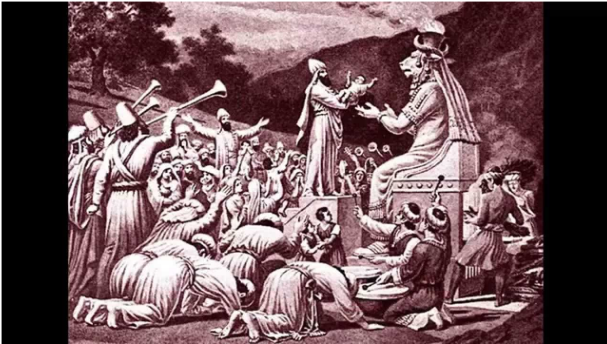
Offering to Molech