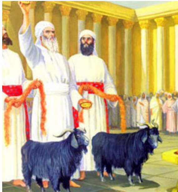
The priest will cast lots for the two goats.