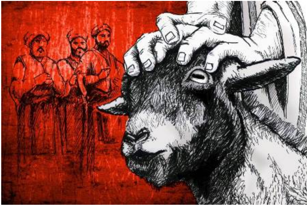
High Priest laying both of his hands on the goat and confessing the sins of Israel