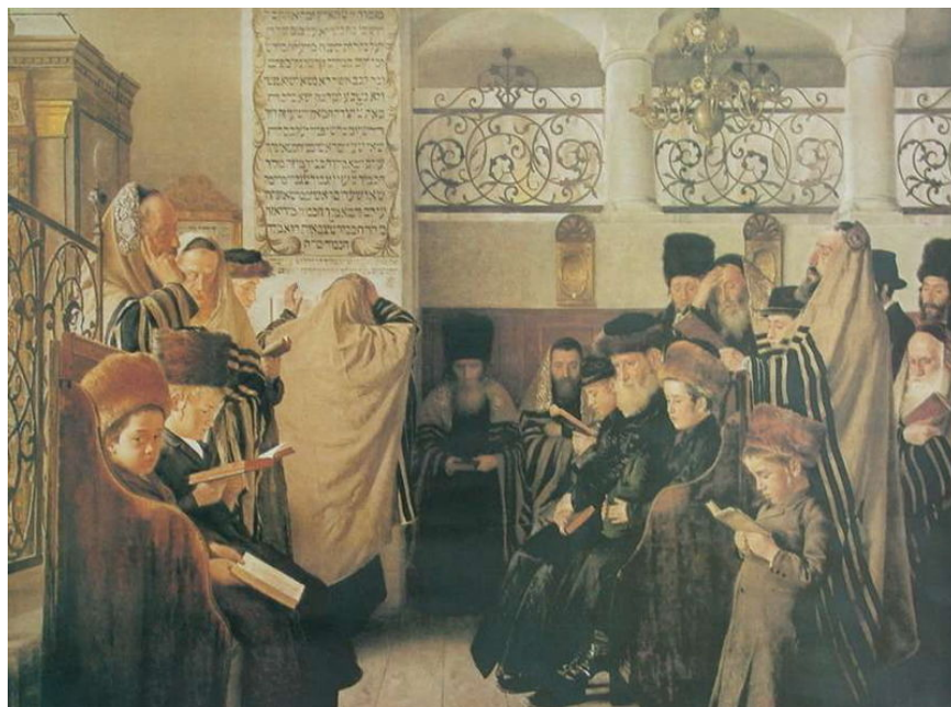
Day of Atonement (painting circa 1900 by Isidor Kaufmann )

Question: Where did יהוה appear in the Sacred Place? יהוה's glory was manifested in the cloud of glory that hovered over the Ark. After the Kohen Gadol entered the Holy of Holies on Yom Kippur, he ignited incense to create a cloud, whereupon יהוה's glory appeared upon the Cover. Chumash