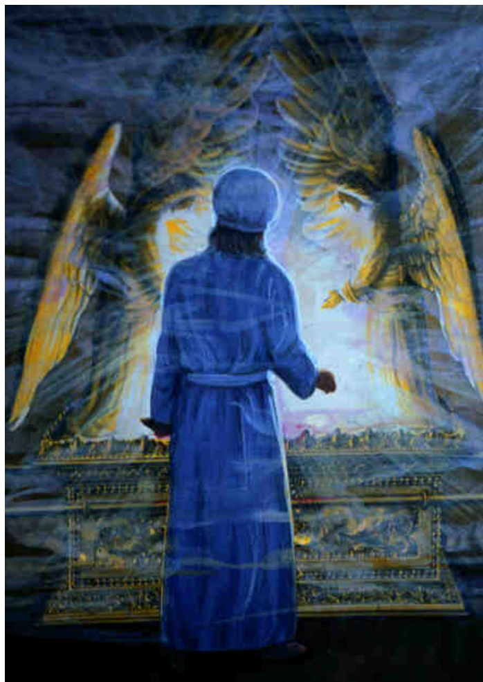
Face to Face

Leviticus 16:14 And he will take the blood of the bullock and sprinkle it with his finger upon the mercy seat towards the east; and he will sprinkle the blood with his finger seven times before the mercy seat. 15 Then he will kill את the goat for הַטָּמֵא the sin [offering] that is for the people and bring את his blood inside the veil and do with את the blood as he did with the blood of the bullock and sprinkle אתו it (him) upon the mercy seat and before the mercy seat: 16 And he will make atonement for the sacred place , because of the uncleanness of the Children of Israel and because of their transgressions and all their sins: and he will do the same for the Tabernacle of the Congregation that remains there אתם with them in the midst of their uncleanness. 17 And no man will be in the Tabernacle of the Congregation when Aaron goes in to make an atonement in the sacred place until he comes out and has made an atonement for himself and for his household and for all the congregation of Israel. Prophecy Fulfilled-Lev.16:15-17 Prefigures Messiah once-for-all death-Hebrews 9:7-14. C-MATS