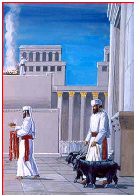
The scapegoat will be presented alive before יהוה

Discuss: Which way are you heading today? Towards righteousness or spiritual death? (You cannot be neutral. You are heading in one direction or the other.)