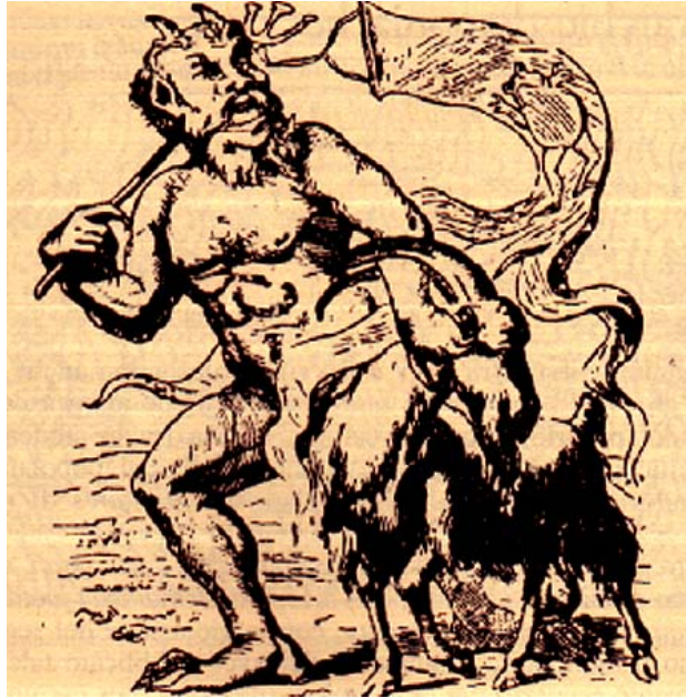
Azazel (from Colin de Plancy's 1825 Dictionnaire Infernal )

Leviticus 17:8 And you will say to them, any man from the House of Israel or the strangers which live among you who offers a burnt offering of sacrifice, 9 And does not bring it to the door of the Tabernacle of the Congregation to offer אָהֵרִי it ( him ) to לִיהוָה; that man will be cut off from among his people. 10 And whatever man there is of the House of Israel, or of the strangers that live among you, that eats any manner of blood; I will even set My face against that soul that eats אֶת־ blood and will cut אֶתֶּה him off from among his people. 11 For the life of the flesh is in the blood: and I have given it to you upon the altar to make atonement for yourselves: for it is the blood that makes atonement for the life. Prophecy Fulfilled-Lev.17:11 The Blood-the life of the flesh-Matthew 26:28; Mark 10:45; It is the blood that makes atonement-1 John 3:14-18. 12 Therefore, אֶמְרָתִי I said to the Children of Israel, None of you will eat blood; neither will any stranger that lives among you eat blood. 13 And any man from the Children of Israel or the strangers that live among you, who hunts and catches any beast or fowl that may be eaten; he will pour out אֶת־ the blood of the animal and cover it with dust. 14 For the life of all creatures; the blood is its life: therefore, I said to the Children of Israel, You will not eat the blood of any kind of creature: for the life of all flesh is in the blood: whoever eats it will be cut off. C-MATS