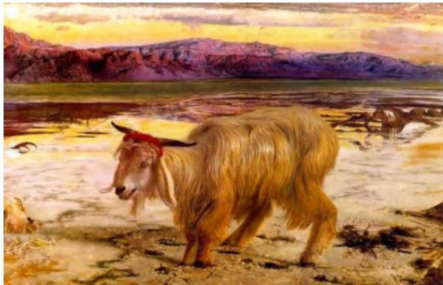
The Scapegoat with the crimson thread tied on it

Leviticus 16:9 And will bring Aaron את־ the goat upon which יהוה lot fell and offer him for a קטאת sin [offering]. 10 But the goat on which the lot fell to be the scapegoat will be presented alive before יהוה to make atonement with him and to let אתו־ him go for a scapegoat into the wilderness. C-MATS