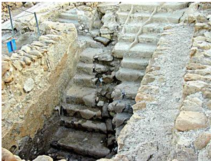
An ancient mikvah in Israel

Leviticus 16:26 And the man that let's go את the scapegoat will wash his clothes and bathe את his flesh in water and then come into the camp. C-MATS