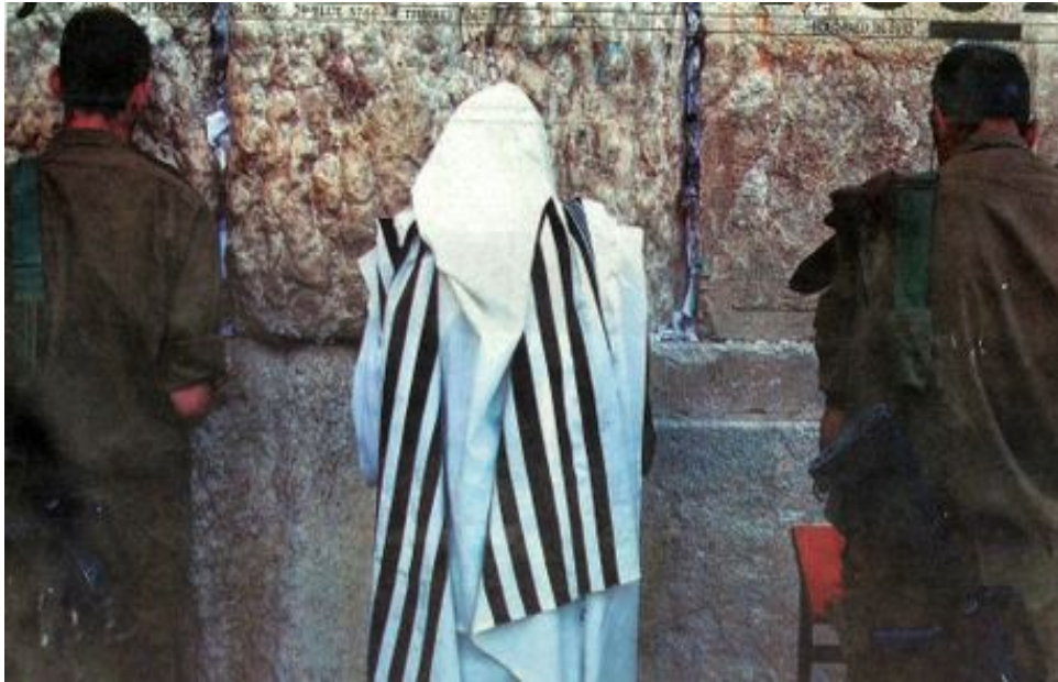
Wearing white at the wailing wall in Jerusalem during Yom Kippur