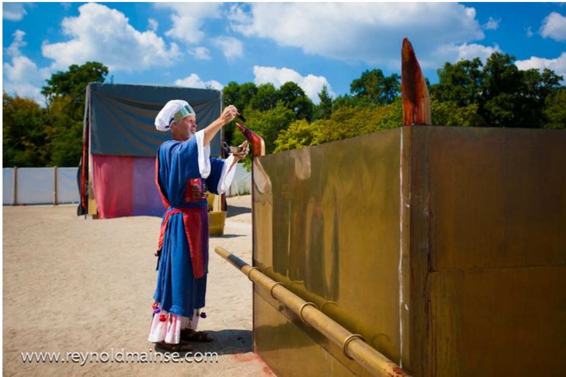
The priest will put the blood on the horns of the altar

Leviticus 16:18 And he will go out to the altar that is before יהוה and make atonement for it; and will take the blood of the bullock and the blood of the goat and put it upon all the horns of the altar. C-MATS