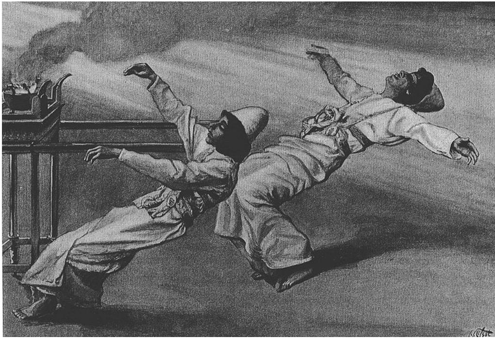
The Two Priests Are Destroyed (watercolor circa 1896–1902 by James Tissot )

Leviticus 16:2 And יהוה said to Moses, speak to Aaron your brother, so that he does not come at all times into the sacred place within the veil before the mercy seat which is upon the Ark, so that he should not die : for I will appear in the cloud upon the mercy seat. C-MATS