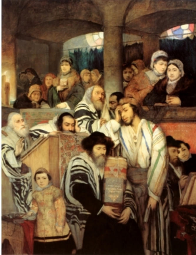
Praying in the Synagogue on Yom Kippur (1878 painting by Maurycy Gottlieb )

Leviticus Chapter 16 is about Yom Kippur ( Day of Atonement ) on the seventh month, tenth day and how to atone for the accidental and unknown sins of את congregation. Notice the placement of the את throughout the chapter in regard to the atoning blood of the bull and in regard to the two goats. These animals and what they will accomplish are extensions of את Messiah's presence upon them once they are consecrated and set apart for without את Yahshua's presence on the sacrifices they cannot be presented to יהוה Father. C-MATS