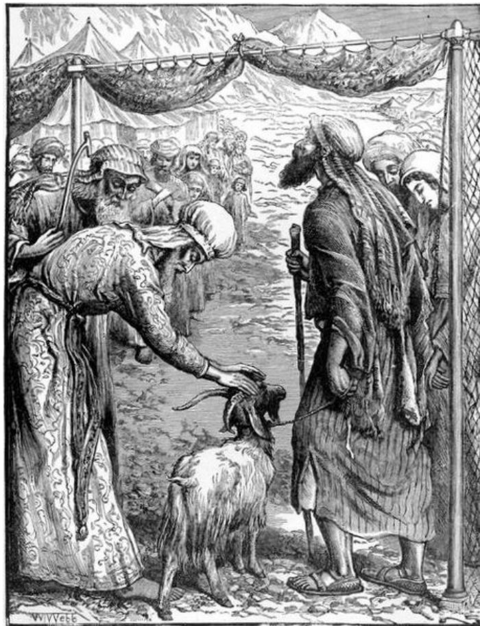
Sending Out the Scapegoat (illustration by William James Webb (1830–1904))

Question: What picture can we see of Yahshua in these scriptures? In Leviticus 16:21 Aaron's hands become את hands when doing the work as high priest and Leviticus 16:23 confirms this, as Aaron's garments are את garments. Notice that all three, the high priest, and the man who lets the scapegoat free and the man who burns the bull and goat that was used for the sin offering and disposes of the animals by fire outside the camp, all three of these men were clean before they began their priestly task but then became unclean and had to wash with water in order to become clean and enter back into the camp of the congregation. This was exactly what happened to Yahshua after His resurrection and why He told Mary not to touch Him ( John 20:17 Yahshua said unto her, Touch me not; for I am not yet ascended to my Father. ) for He had to apparently ascend to יהוה Father who would accept His sacrifice and make Him clean for Yahshua having taken on the sins of the world, cried out, “My Elohim, my Elohim, why have you forsaken me?” (Matthew 27:46) as יהוה Father turned away and removed His Holy Spirit, His divine presence from within Him. C-MATS