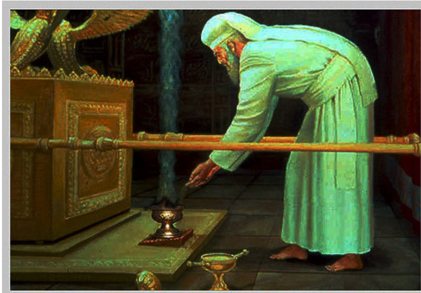
The priest will put incense on the censer filled with burning coals.

Leviticus 16:11 And will bring Aaron את the bullock of הַתְּשֻׁאָה the sin [offering] which is for him and will make atonement for himself and for his house and will kill את the bullock for הַתְּשֻׁאָה the sin [offering] which is for him. C-MATS