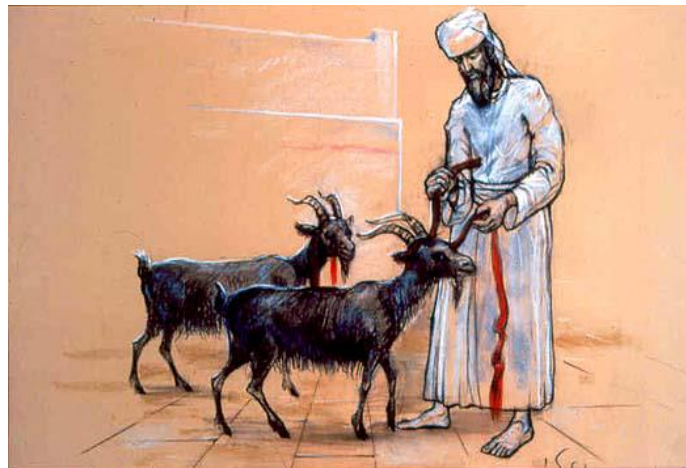
The priest will present the two goats before יהוה.

Question: The he-goat for Azazel , which was to be thrown over the cliff, and the one offered to יהוה were (preferably) to be identical in color, height, and value. Why should the Israelites have to spend extra sums of money on a he-goat that will anyhow be thrown over a cliff? The money we spend during our lifetime can be divided into two parts: One goes to spiritual matters and the other to physical necessities and personal pleasures. Unfortunately, many people who are blessed with affluence spend freely on personal amenities yet plead poverty when it comes to spending money on spiritual matters. In retrospect, we often feel that money spent on pleasures has been wasted. However, money spent on the spiritual has an everlasting effect. The two he-goats can also serve as metaphors for these above-mentioned two categories of expenses. And the instruction of Torah that they should be of equal value, conveys an important lesson. יהוה, in His benevolence, does not mind how much money we spend or waste on our personal pleasures. He requests however, that at least an equal amount of money (and perhaps more) be spent on spiritual matters. If one has money for “ Azazel ” — to throw over the cliff — one should not plead poverty when it comes to spending for יהוה. Chumash