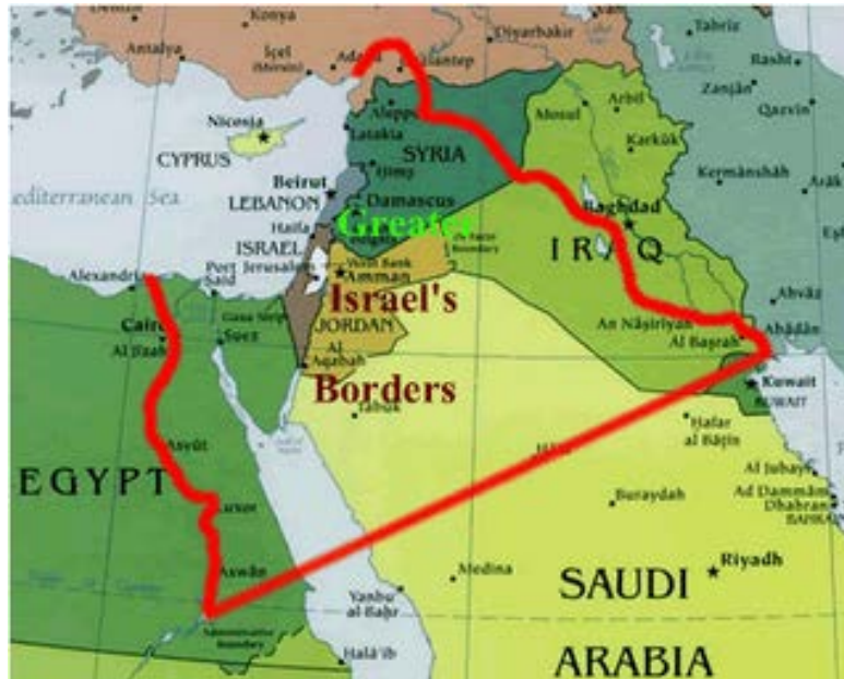
Borders of Israel at the coming of the Messiah

Question: What Land was Moses describing in verse 24? The borders given in Numbers 34:1-12 are nowhere near the Euphrates. Those were the borders of the generation that entered the Land. Here Moses looked ahead to the coming of Messiah, when the Euphrates will be the border of the Land.