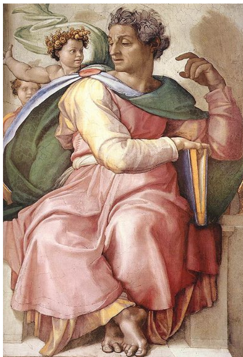
Isaiah (Jesaja) - fresco at the Sistine Chapel by Michelangelo

Isaiah 54:11 O you afflicted, tossed with tempest and not comforted, see, I will lay with fair colors, your stones and lay your foundations with sapphires. 12 And I will make rubies your windows of and your gates of carbuncles and all your borders of stones pleasant. 13 And all your children will be taught of יהוה; and great will be the peace of your children. 14 In righteousness will you be established: you will be far from oppression; for you will not fear: and from terror; for it will not come near you. 15 See, they will certainly gather together, but not by Me: whoever will gather together אֶתְּךָ against you for your sake will fall. 16 See, I have created the smith that blows in the fire the coals and that brings forth an instrument for his work; and I have created the waster to destroy. 17 No weapon that is formed against you none will prosper; and every tongue that will rise אֶתְּךָ against you in judgment you will condemn. זֵאת This is the heritage of the servants of יהוה and their righteousness is of Me, says יהוה.