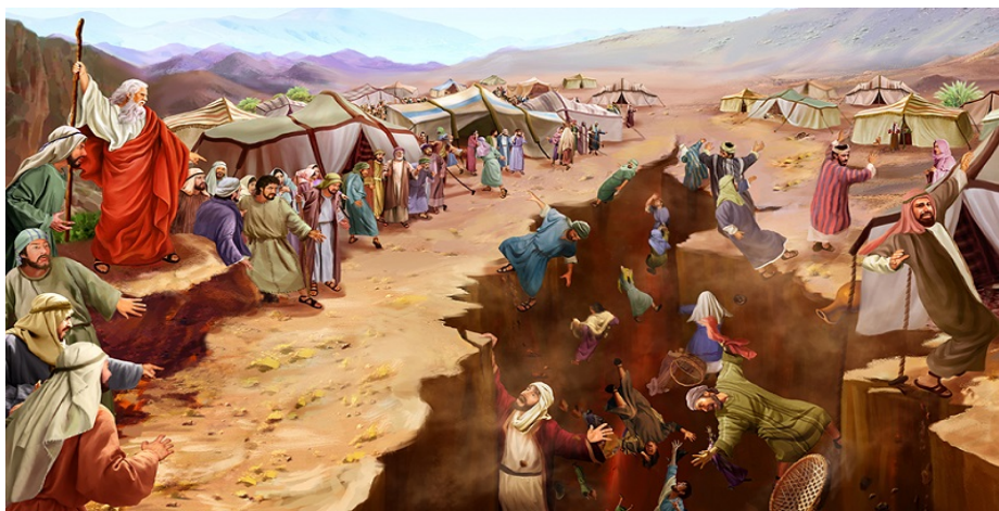
Destruction of Korah Dathan and Abiram

Deuteronomy 11:5 And what He did for you in the wilderness until you came to this place; 6 And what He did to Dathan and Abiram, the sons of Eliab, the son of Reuben: how opened the earth את her mouth and swallowed them up את and their households את and their tents את and all the substance that was in their possession before all Israel: C-MATS