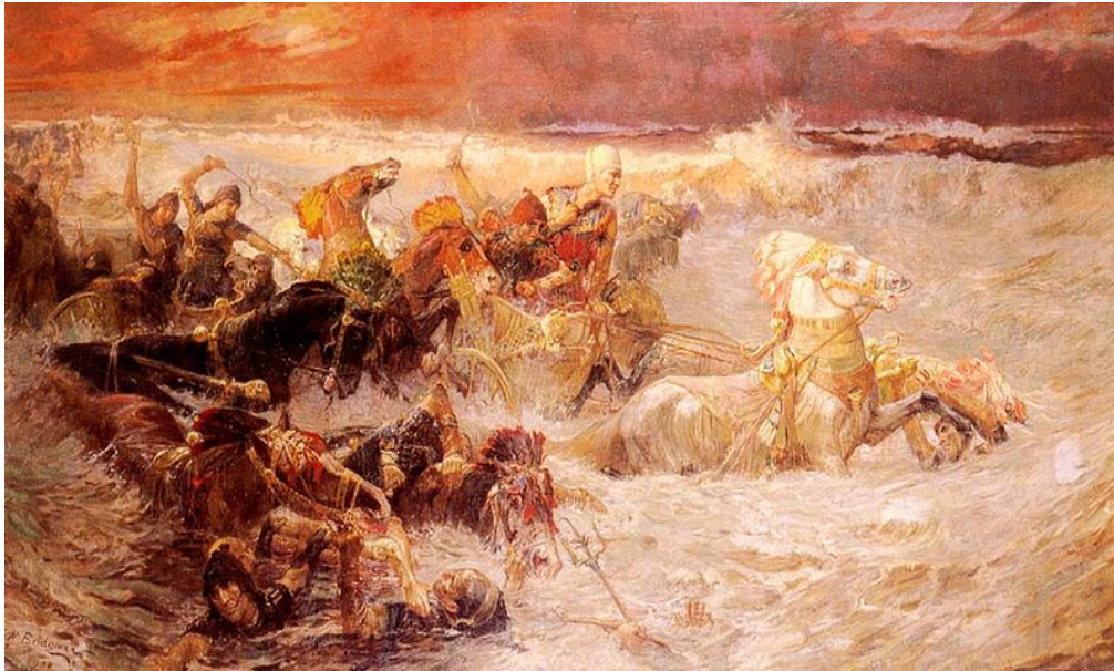
Pharaoh's Army Engulfed by the Red Sea (painting by Frederick Arthur Bridgman )

Deuteronomy 11:4 And what He did to the army of Egypt, to their horses and to their chariots; how He made to flow over them את the water of the Red Sea to overtake them as they were pursuing you and יהוה destroyed them to this day. C-MATS