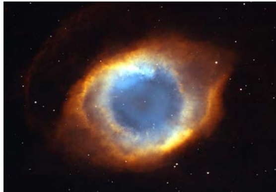
'Eye of God Nebula' (AKA the Helix Nebula)

Deuteronomy 11:7 But your eyes have seen את all the great acts of יהוה which He did. 8 Therefore, keep את all the commandments, which I command you this day, that you may be strong and go in and possess את the land, which אתם you go to possess it; 9 And that you may prolong your days in the land, which יהוה swore to your fathers to give to them and to their descendants, a land that flows with milk and honey . 10 Because the land, that אתה you go in to possess, is not like the land of Egypt from which you came, where you sow את your seed and water it with your foot ( to operate the irrigation system ) as in a vegetable garden: 11 But the land that אתם you go to possess is a land of hills and valleys and is watered by rain from the heavens: 12 A land which יהוה your Elohim cares for: the eyes of יהוה your Elohim are always upon אתה it (her) , from the beginning of the year to אחרית the end of the year. C-MATS