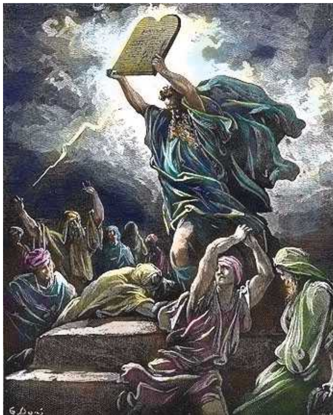
Moses Breaking the Two Tablets of Stone

Deuteronomy 9:17 And I took the two tablets and threw them out of my hands and broke them before your eyes.