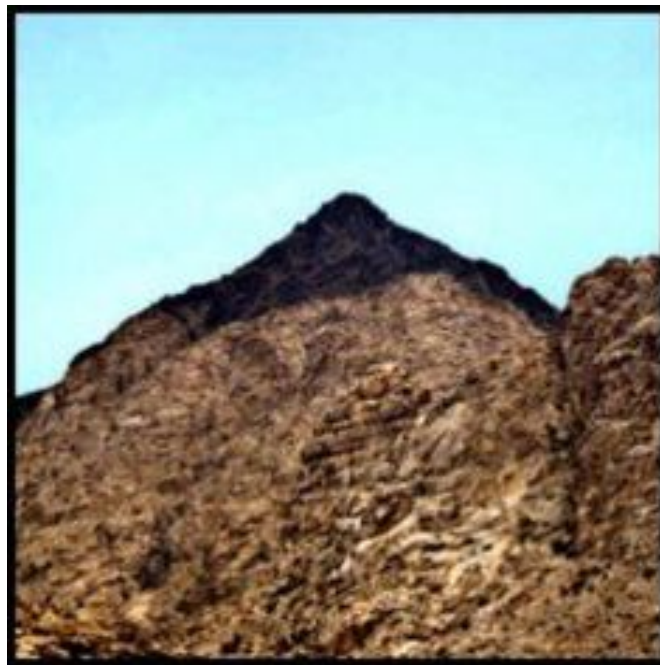
Mount Horeb blackened on top where יהוה came down

Deuteronomy 9:5 אתה You do not go in to possess את their land because of your righteousness or the uprightness of your heart: but יהוה your Elohim will drive them out before you, because of the wickedness of these nations, so that He may perform את the word , which יהוה swore to your fathers, Abraham, Isaac and Jacob. 6 Understand that יהוה your Elohim does not give you האזאת this את land that is good to possess, because of your righteousness, because אתה you are a stiff-necked people. 7 Remember and don't forget את how you provoked את יהוה your Elohim to wrath in the wilderness: from the day that יצאת you came out of the land of Egypt until you came to this place, you have been rebellious against יהוה . 8 Also in Horeb you provoked to wrath את יהוה , so that יהוה was angry enough with you to destroy אתכם you . 9 When I went up the mountain to receive the tablets of stone, the tablets of the covenant which יהוה made with you and I remained on the mountain for forty days and forty nights, אכלתי I ate no bread or drank water: 10 And delivered את יהוה to me את two tablets of stone written with the finger of Elohim; and on them all the words were written , which יהוה spoke with you on the mountain out of the midst of the fire on the day of the assembly. C-MATS