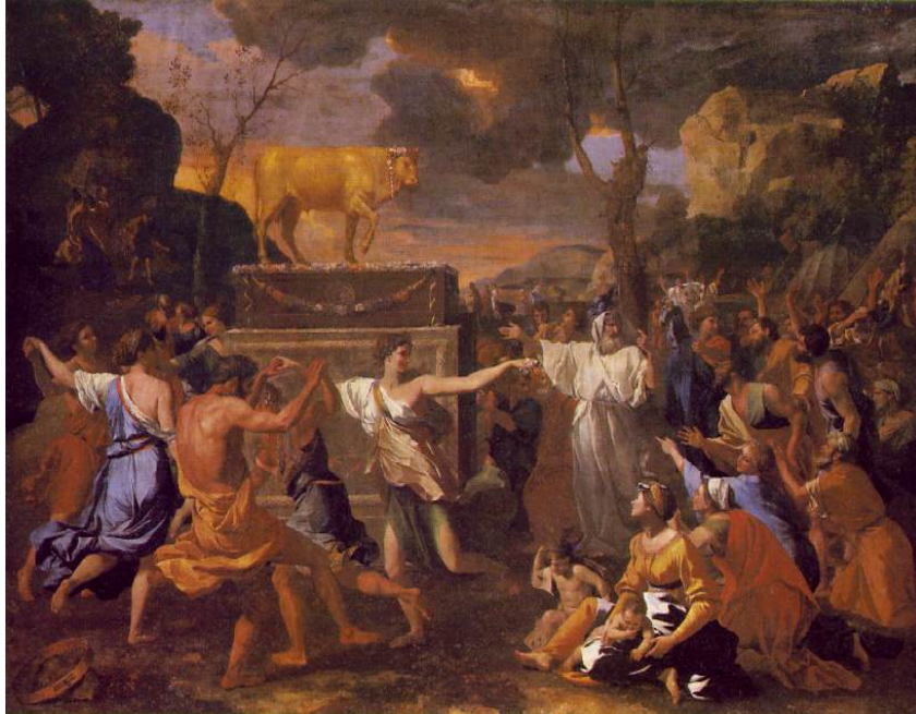
Adoration of the Golden Calf, oil on canvas by Nicolas Poussin 1634

Deuteronomy 9:17 And I took the two tablets and threw them out of my hands and broke them before your eyes. C-MATS