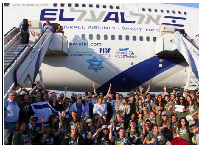
Jews return to Israel in record numbers

Question: What encouragement does יהוה give His people? After the fearsome warnings of what will befall the nation when it is disloyal to יהוה, the Torah turns to the eventual benevolence that יהוה will shower upon His people when they repent. These promises have not been fulfilled as yet; they will come about in the Messianic era. Chumash