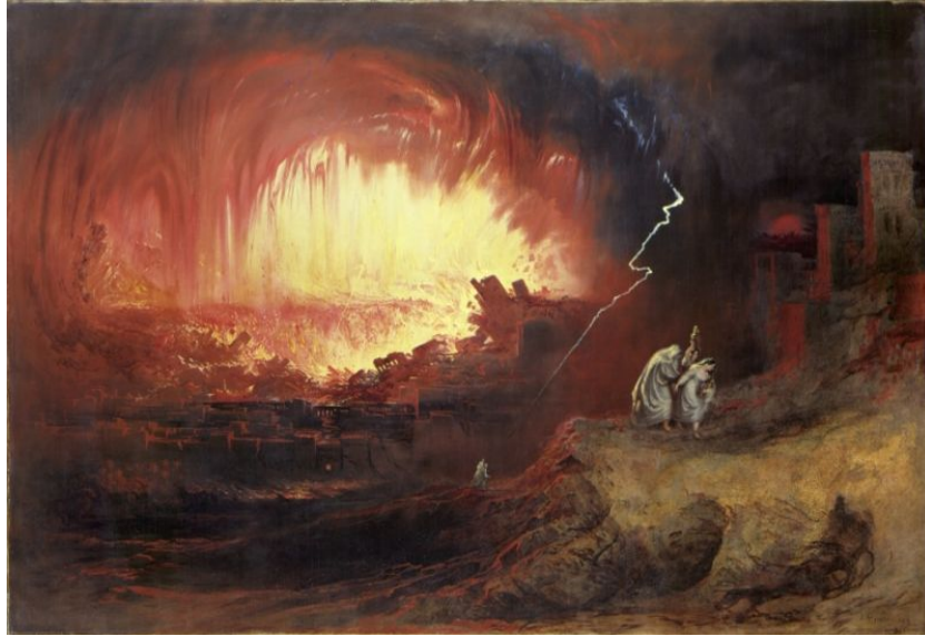
Sodom and Gomorrah

Deuteronomy 29:22 So that the coming generation of your children and the stranger that will come from a far land will say when they see את the plagues of that land ואת and the sicknesses which יהוה has laid upon it; 23 And the whole land becomes burning brimstone and salt, so that it is not planted or bears crops and no grass grows there, like the overthrow of Sodom and Gomorrah, Admah and Zeboim, which יהוה overthrew in his anger and in his wrath. C-MATS