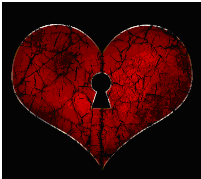
Encouragement heals the heart.

Question: Are there times that we shouldn't encourage someone to accomplish his goal? If we feel that their goal could harm themselves or others, we shouldn't encourage it. But other than that, we do people a big favor by encouraging them.