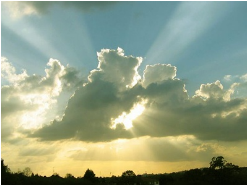
Heaven and earth are witnesses of יהוה's warning.

Question: Does everyone have same range of free choice or does it differ among people? Each of us has our own free choice range. This means that according to our age, personality and experiences, we all have an area where we are equally pulled by competing values and may freely choose to which we will respond. For instance, for a child growing up in an inner city broken home, whether to rob a store or not is a difficult moral choice. For someone else, it would be out of the question, whereas his moral choice might involve whether or not to return extra change he has been given. It is how we choose in our own personal free choice range that determines whether or not we are growing spiritually.