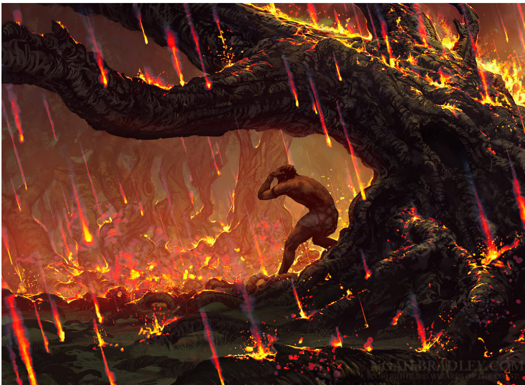
The anger of יהוה will burn against you.

Question: How will יהוה add to the punishment? Because I will add to him the punishment for what he committed unintentionally, which I would have overlooked, but now, he has caused Me to combine them with the intentional sins and punish him for everything.