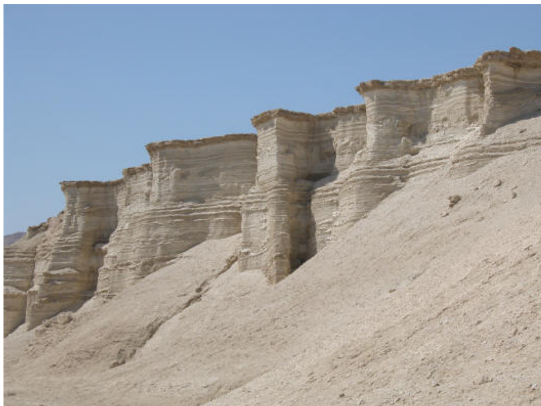
Sodom and Gomorrah today

Deuteronomy 29:22 So that the coming generation of your children and the stranger that will come from a far land will say when they see את the plagues of that land ואת and the sicknesses which יהוה has laid upon it; 23 And the whole land becomes burning brimstone and salt, so that it is not planted or bears crops and no grass grows there, like the overthrow of Sodom and Gomorrah, Admah and Zeboim, which יהוה overthrew in his anger and in his wrath. C-MATS