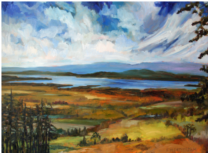
At the far end of the sky

Question: יהוה forgives those who strayed from Him once they sincerely repented. We can learn from here to forgive other people, too. Is there a spiritual outlook that can help us to forgive others? It is a spiritual fact that nothing can happen to us and no one can do anything to us unless it's יהוה's will. It is also so, that יהוה only sends us what is for our ultimate best (even though we can't see it that way). Therefore, if someone says or does something unkind to us, we can remember he is only an 'agent' of יהוה's will and therefore it will be easier to forgive.