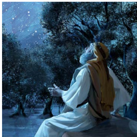
יהוה covenant with Abraham to bless his seed

Question: What does Moses mean by “ את the covenant”? The covenant is יהוה’s oath to Abraham (I will establish את My covenant between Me and you and your descendants for all generations as an everlasting covenant, to be an Elohim to you and to your seed. Genesis 17:7). This refers to יהוה’s special relationship with Israel, whereby His bounty flows directly to His people, without intermediaries. Chumash