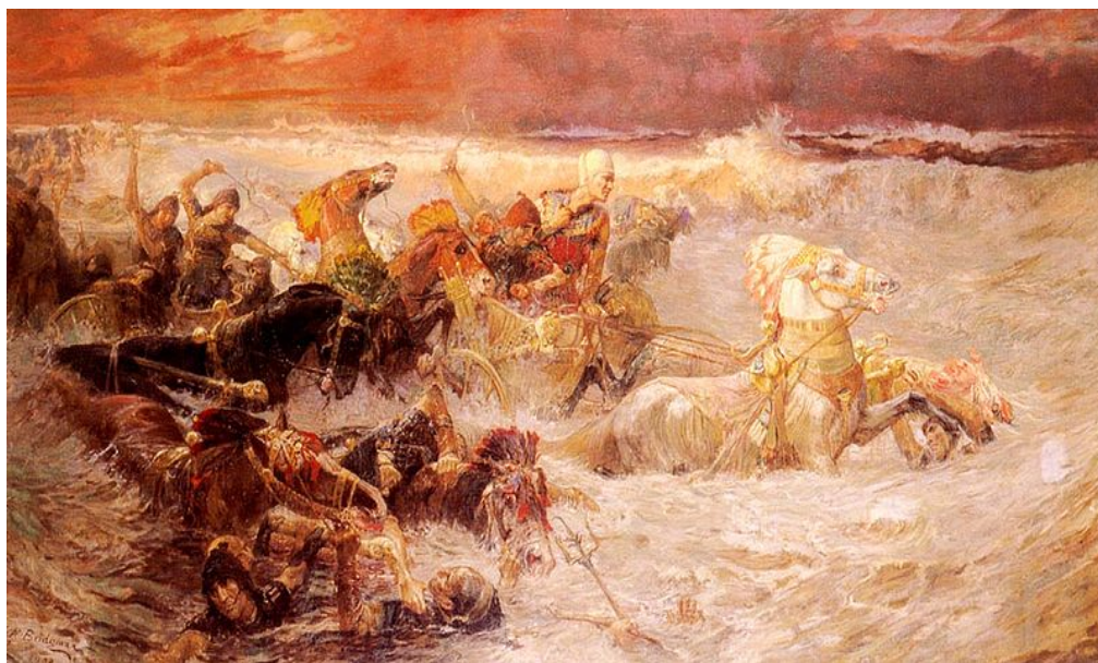
Pharaoh's Army Engulfed by the Red Sea (painting by Frederick Arthur Bridgman )

4 And what He did to the army of Egypt, to their horses and to their chariots; how He made to flow over them את- the water of the Red Sea to overtake them as they were pursuing you and יהוה destroyed them to this day. C-MATS