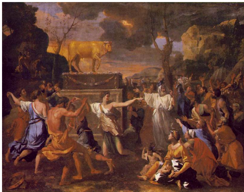
Adoration of the Golden Calf, oil on canvas by Nicolas Poussin 1634

Deuteronomy 9:11 And it came to pass at the end of forty days and forty nights, that יהוה gave me את־ two tablets of stone, the tablets of the covenant. 12 And יהוה said to me, Arise, go down quickly; because your people, which you have brought out of Egypt, have corrupted themselves ; they have quickly turned aside from the way which I commanded them; they have made themselves a molten image. 13 Furthermore יהוה spoke to me saying, רֵאִיתִי I saw את־ people and see that they are a stiff-necked people: 14 Let Me alone that I may destroy them and blot out את־ their name from under heavens: and I will make from אותְךָ you a nation mightier and greater than they. 15 So I turned and came down from the mountain and the mountain burned with fire: and the two tablets of the covenant were in my hands. 16 And I looked and saw that you had sinned to ליהוה your Elohim and had made a molten calf: You had turned aside quickly from the way which יהוה had commanded אתְכֶם you . C-MATS