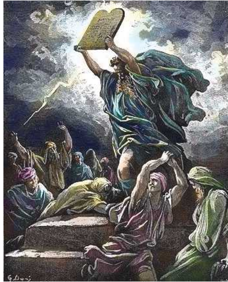
Moses Breaking the Two Tablets of Stone

Deuteronomy 9:17 And I took the two tablets and threw them out of my hands and broke them before your eyes. C-MATS