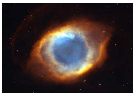
'Eye of God Nebula' (AKA the Helix Nebula)

Deuteronomy 11:7 But your eyes have seen אַתְּ all the great acts of יְהוָה which He did. 8 Therefore, keep אַתְּ all the commandments, which I command you this day, that you may be strong and go in and possess אַתְּ the land, which אַתֶּם you go to possess it; 9 And that you may prolong your days in the land, which יְהוָה swore to your fathers to give to them and to their descendants, a land that flows with milk and honey. 10 Because the land, that אַתֶּה you go in to possess, is not like the land of Egypt from which you came, where you sow אַתְּ your seed and water it with your foot (to operate the irrigation system) as in a vegetable garden: 11 But the land that אַתֶּם you go to possess is a land of hills and valleys and is watered by rain from the heavens: 12 A land which יְהוָה your Elohim cares for: the eyes of יְהוָה your Elohim are always upon אַתֶּה it (her), from the beginning of the year to אַחֲרִית the end of the year. C-MATS