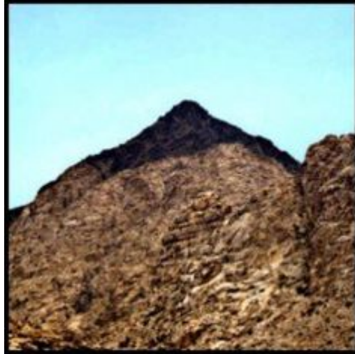
Mount Horeb blackened on top where יהוה came down

Deuteronomy 9:11 And it came to pass at the end of forty days and forty nights, that יהוה gave me את־ two tablets of stone, the tablets of the covenant. 12 And יהוה said to me, Arise, go down quickly; because your people, which you have brought out of Egypt, have corrupted themselves ; they have quickly turned aside from the way which I commanded them; they have made themselves a molten image. 13 Furthermore יהוה spoke to me saying, רֵאִיתִי I saw את־ people and see that they are a stiff-necked people: 14 Let Me alone that I may destroy them and blot out את־ their name from under heavens: and I will make from אותְךָ you a nation mightier and greater than they. 15 So I turned and came down from the mountain and the mountain burned with fire: and the two tablets of the covenant were in my hands. 16 And I looked and saw that you had sinned to ליהוה your Elohim and had made a molten calf: You had turned aside quickly from the way which יהוה had commanded אתְכֶם you . C-MATS