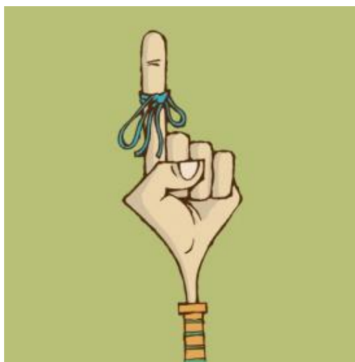
Do Not Forget

Deuteronomy 8:12 When you have eaten and are full and have built good houses and lived there; 13 And when your herds and your flocks multiply and your silver and your gold multiply and all that you have is multiplied; 14 When your heart is lifted up and you forget את יהוה your Elohim, who brought you out of the land of Egypt from the house of bondage; 15 Who led you through that great and terrible wilderness, in which were fiery serpents and scorpions and drought, where there was no water; and He brought out water from the rock of flint for you; 16 Who fed you in the wilderness with Manna, which your fathers did not know, that He might humble you and that He might prove you, in order to do good things for you in the end; 17 ואמרת And you say in your heart, my power and the might of my hand have brought me את wealth and all this. 18 But you must remember את יהוה your Elohim: because it is He that gives you power to get wealth that He may establish את His covenant, which He swore to your fathers, as is happening to you this day. 19 But if you do forget את יהוה your Elohim and walk after other gods and serve them and worship them, I testify against you this day that you will certainly perish. 20 You will perish like the nations which יהוה destroyed before your face, because you would not be obedient to the voice of יהוה your Elohim. C-MATS