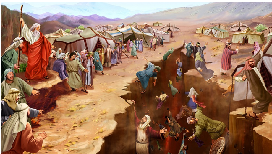
Destruction of Korah Dathan and Abiram

Deuteronomy 11:5 And what He did for you in the wilderness until you came to this place; 6 And what He did to Dathan and Abiram, the sons of Eliab, the son of Reuben: how opened the earth אַתְּ her mouth and swallowed them up אֶתְּ and their households אֶתְּ and their tents אֶתְּ and all the substance that was in their possession before all Israel: C-MATS